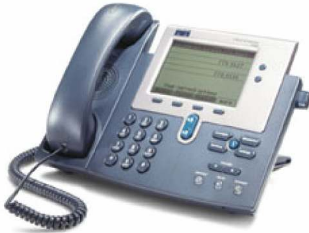
Figure 1. Cisco IP Phone 7940G

The Cisco IP Phone 7940G, a key offering in the IP Phone portfolio, addresses the communication needs of a transaction type worker. It provides two programmable line and feature keys, plus a high quality speakerphone. The Cisco IP Phone 7940G also has four dynamic soft keys that guide users through call features and functions. Built-in headset port and integrated Ethernet Switch are standard with the Cisco IP Phone 7940G. Also includes audio controls for full duplex speakerphone, handset and headset. The Cisco IP Phone 7940G also features a large, pixel-based LCD display. The display provides features such as date and time, calling party name, calling party number, and digits dialed.