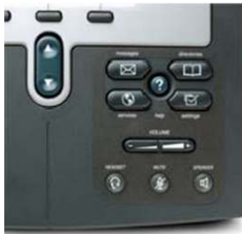
With Word Overlay, English (Included in documentation package with each phone)

The graphic capability of the display allows for the inclusion of such features as XML (Extensible Markup Language) and future features. The 7940G is multi-protocol capable (SCCP, SIP, MGCP).